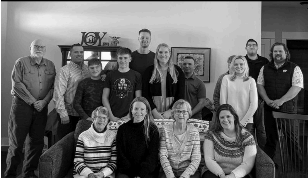
Sunday Afternoon Small Group