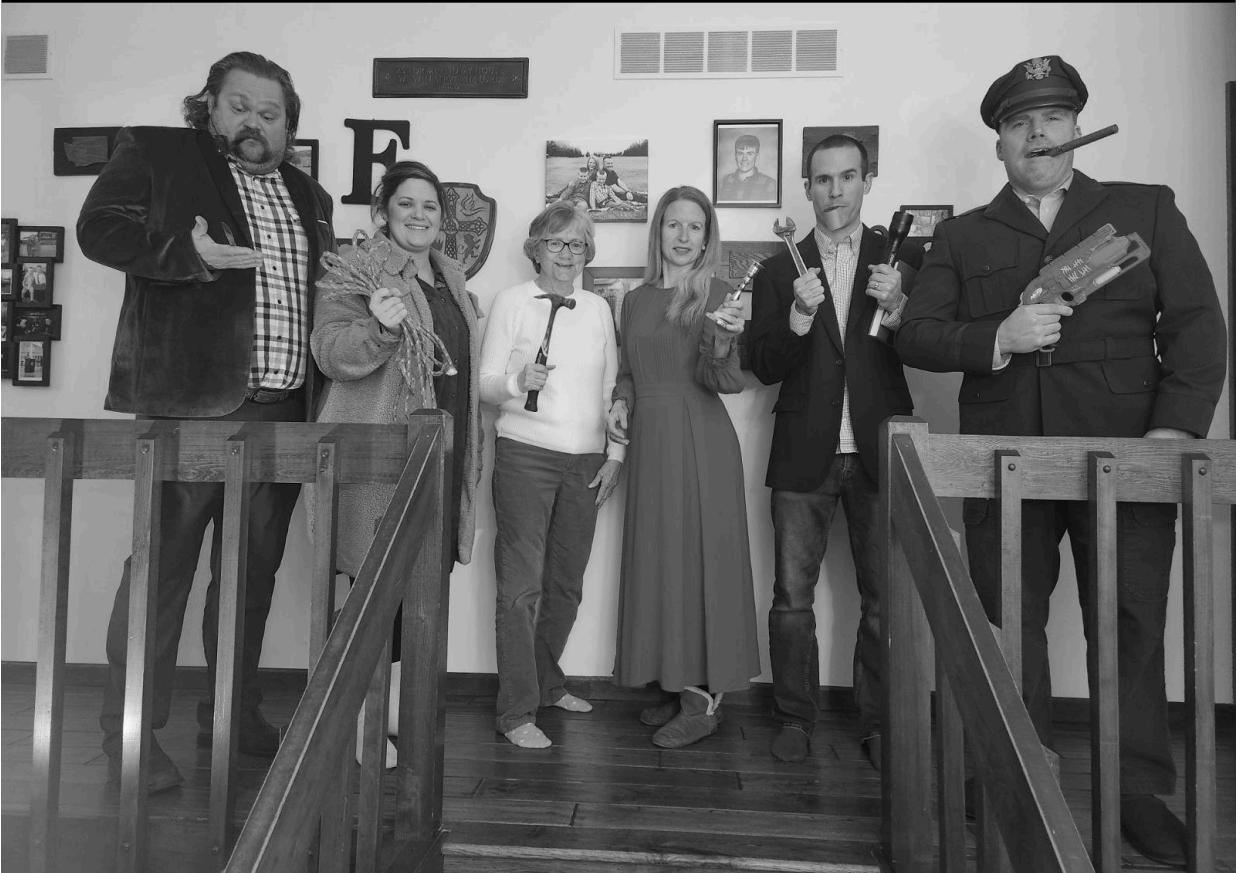
Characters in Youth Fellowship Night game of Clue