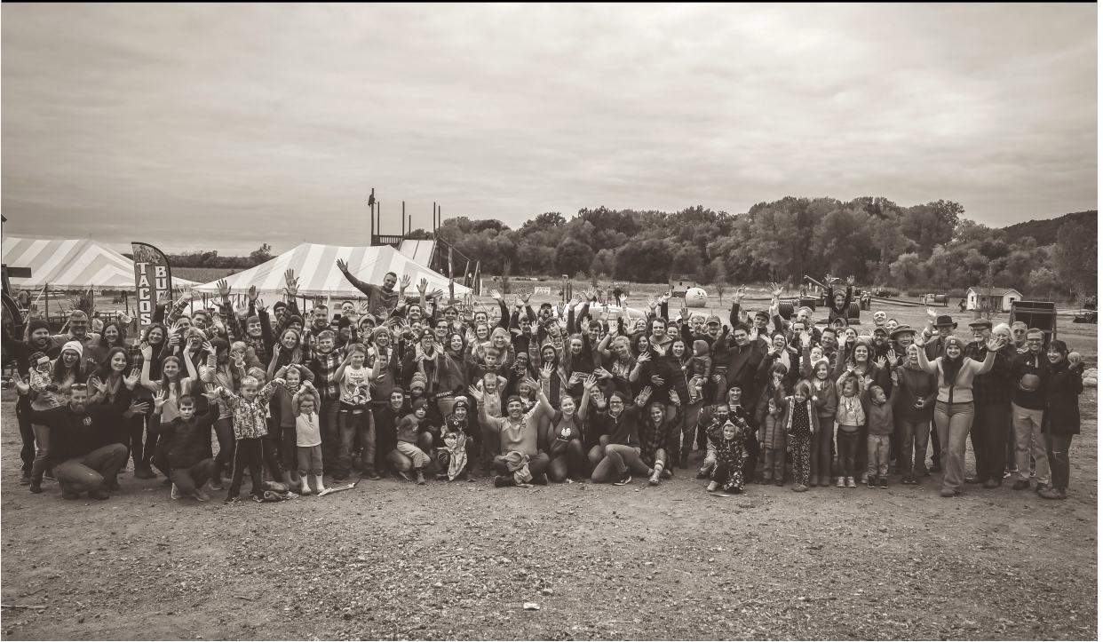
10 Year Celebration at Britt's Farm