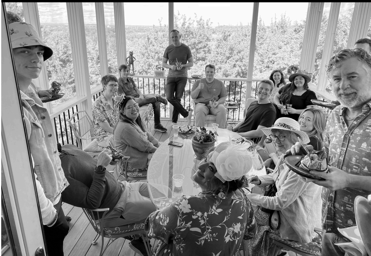
Derby De Mayo (Progressive Dinner)